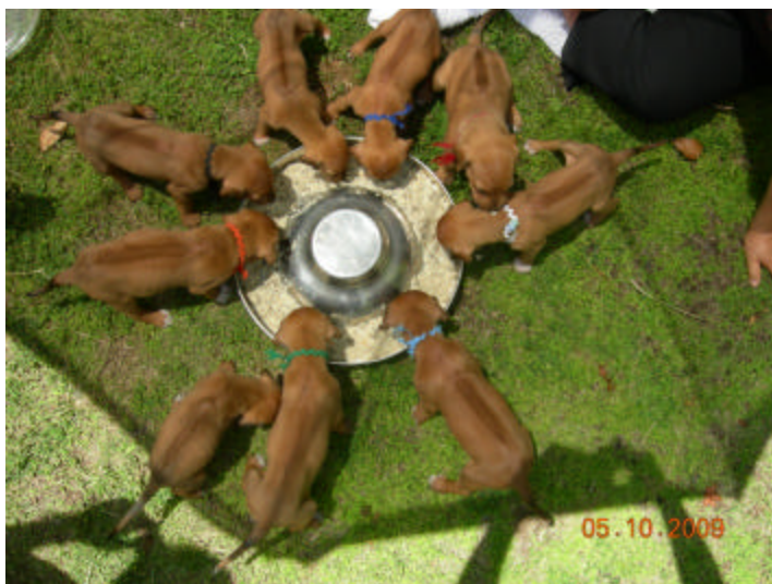
Rosie's litter at about 1 month, feeding and dreaming of being ranked in RRCUS top agility listing.