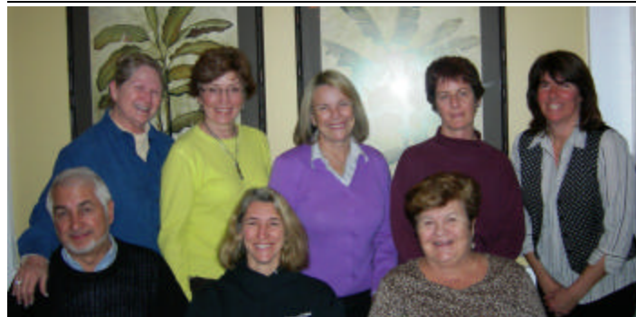
OCRRC Board of Directors for 2010

Editor's Note: The President wrote this message in Dec, due to technical difficulties Rambles was delayed until now.