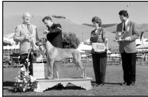
Best of Opposite Sex Ch. Ushamwari's Nori