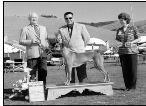
Winner's Bitch Rdsnds Archetype Speed of Light