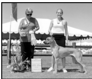
Best in Sweeps Reblrdge Sir Barkley B. Barkin'