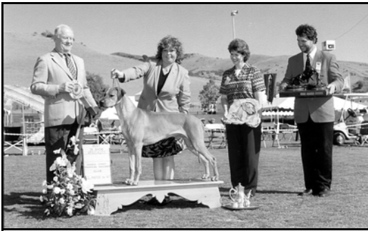
Best of Breed Ch. Kwetu's Mahubah's Fair Play