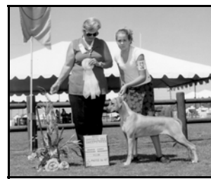
Best of Opposite in Sweeps Primetime's Never Been Kissed