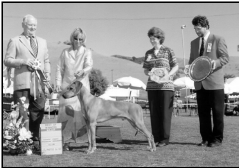
Winner's Dog/Best of Winners Firedance's Fafner